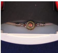
*Grounding Provisions Standard