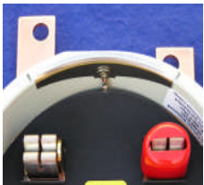
*Ground Flanges Standard