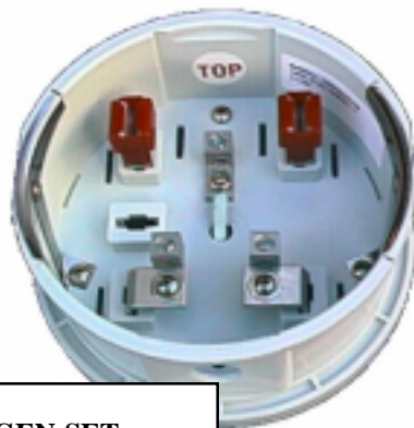
GEN-SET with meter storage

May be sealed with a standard meter ring.