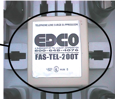
EDCO Model FAS-TEL-200T